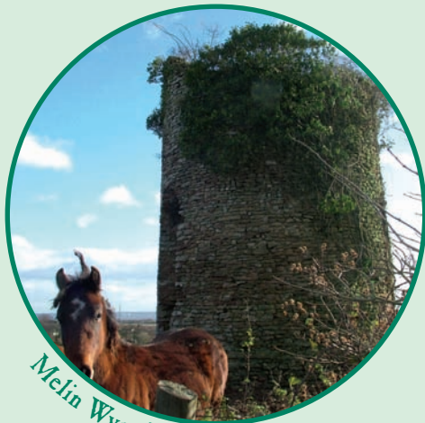
Melin Wynt Rogiet

Ychydig oddi ar y prif lwybr mae enghraifft o graffiti coed F . Yr artistiaid honedig oedd milwyr Pwyleg a oedd wedi'u lleoli yn