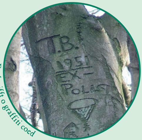
Enghraifft o graffiti coed

Domesday, ac mae'n cynnwys pensaerniaeth y drydedd ganrif ar ddeg yn bennaf gydag estyniadau yn dyddio o'r bedwaredd ganrif ar ddeg. Bôn croes canoloesol y fynwent yw un o'r strwythurau gorau o'i math sydd wedi goroesi.