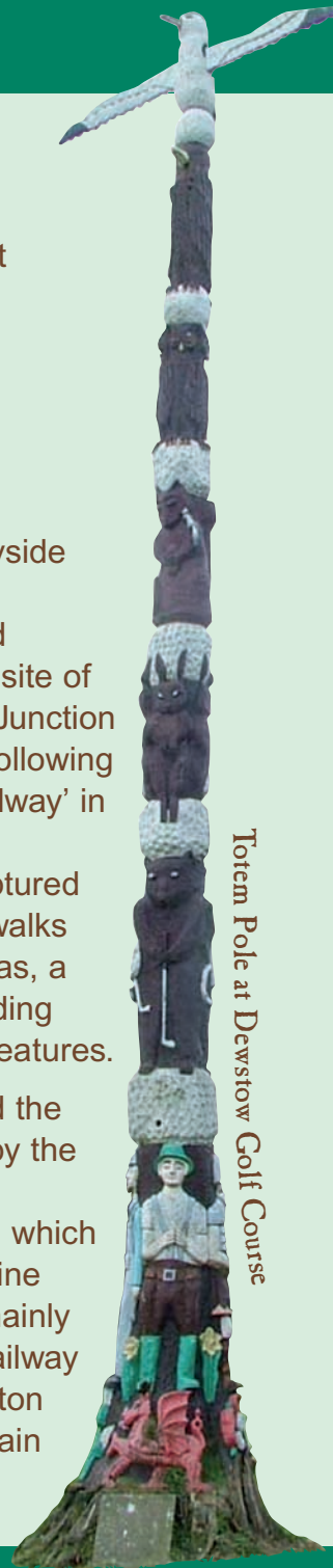
Totem Pole at Dewstow Golf Course

As you walk around the trail you will cross by the remains of the embankment B on which the quarry railway line was constructed; mainly used to transport railway track ballast from Ifton Quarry C to the main railway line.