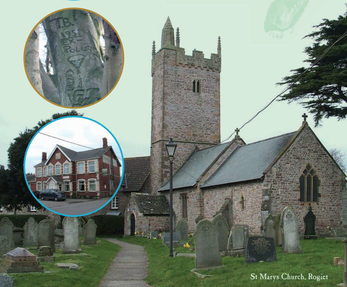
St Marys Church, Rogiet

MONMOUTHSHIRE'S CULTURAL HERITAGE TREFTADAETH DDIWYLLIANNOL SIR FYNWY