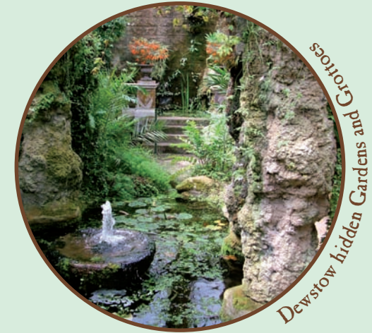
Dewstow hidden Gardens and Grottoes